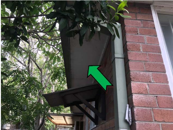
Photo 1. Exterior, throughout, eaves – non asbestos containing fibre cement sheeting.