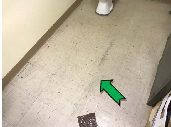
Photo 2. Interior, throughout, floor – non asbestos containing vinyl floor tiles.